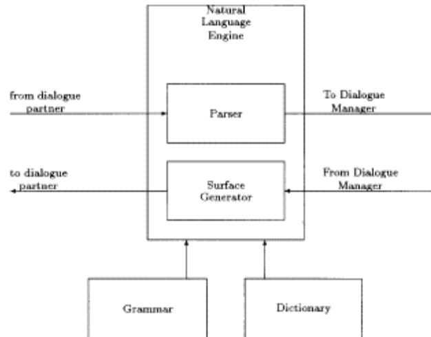
Figure 2: Natural Language Engine